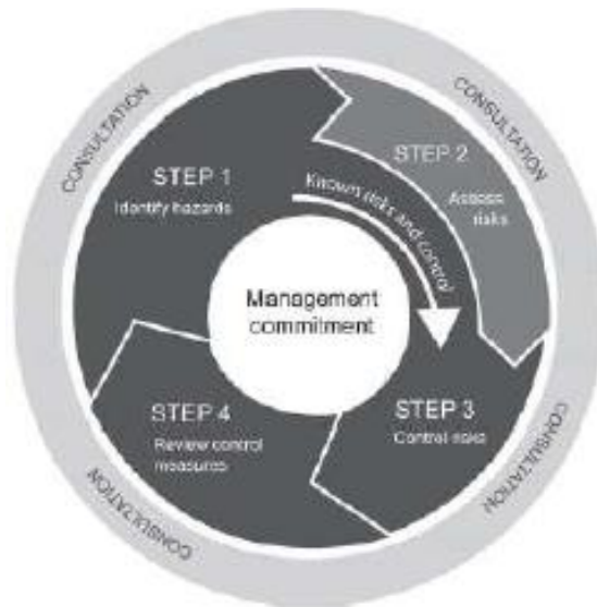
Figure 1: The risk management process

If, after identifying a hazard, we already know the risk and how to control it effectively, FBSU just implements the controls.